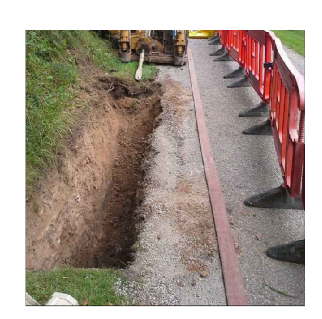
TYPICAL DRILLING RIG & LAUNCH PIT

DO NOT SCALE FROM THIS DRAWING. USE FIGURED DIMENSIONS IN ALL CASES. VERIFY DIMENSIONS ON SITE AND REPORT ANY DISCREPANCIES TO THE DESIGNERS IMMEDIATELY. THIS DRAWING TO BE READ IN CONJUNCTION WITH THE DESIGNERS © THIS DRAWING IS COPYRIGHT AND MAY ONLY BE REPRODUCED WITH THE DESIGNERS PERMISSION.